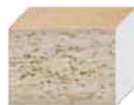
ideal laminate and core finish