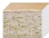
reduces reasonable core cut, but laminate edges may chip