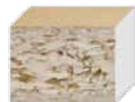
laminates cut quality is good, but core plucking increases